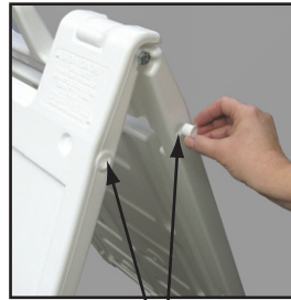
Sand Fill Holes

Each sign frame has four fill holes, two on each side of the frame.